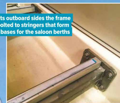
On its outboard sides the frame is bolted to stringers that form the bases for the saloon berths