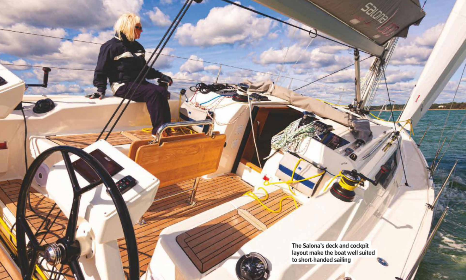
The Salona's deck and cockpit layout make the boat well suited to short-handed sailing