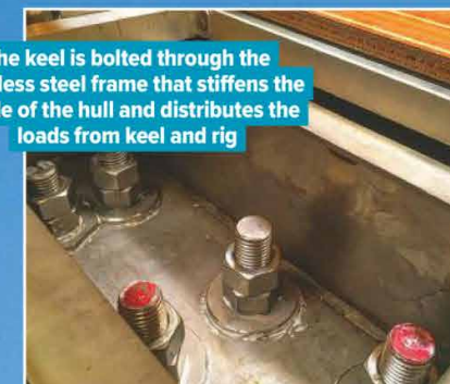
The keel is bolted through the stainless steel frame that stiffens the inside of the hull and distributes the loads from keel and rig